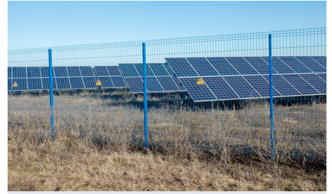
Industrial: Power infrastructure, oil and gas, water treatment facilities