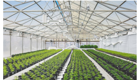
Farming and cannabis: Fields, greenhouses, equipment storage