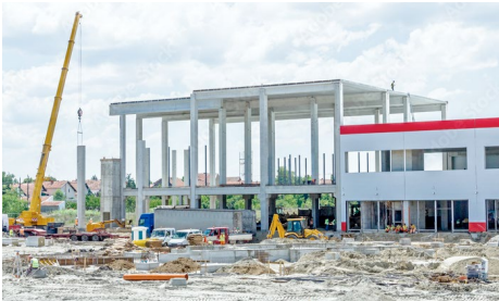
Construction: Site surveillance and perimeter security