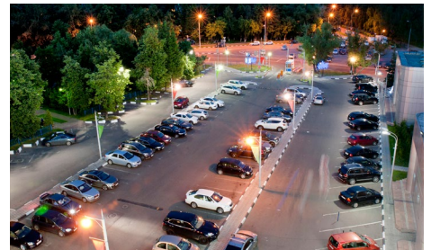
Parking: Commercial/gated garages, perimeter parking areas