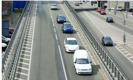
Municipal: Roads, parks, and recreational facilities