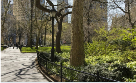
Recreation: Parks and outdoor facilities