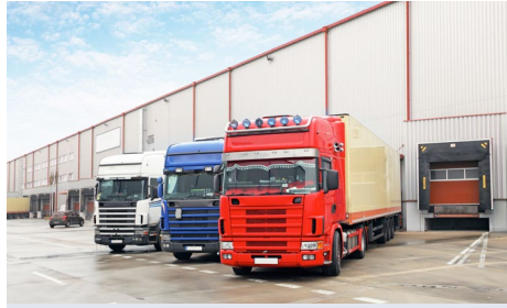
Commercial: Warehouses and lots, equipment/fleet parking